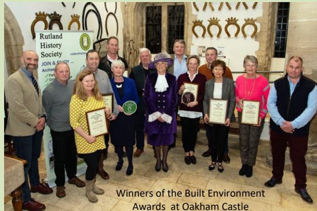
Winners of the Built Environment Awards at Oakham Castle