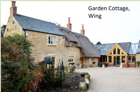
Garden Cottage, Wing