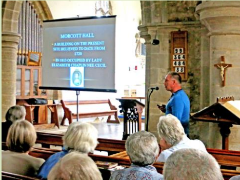
Morcott Village Visit