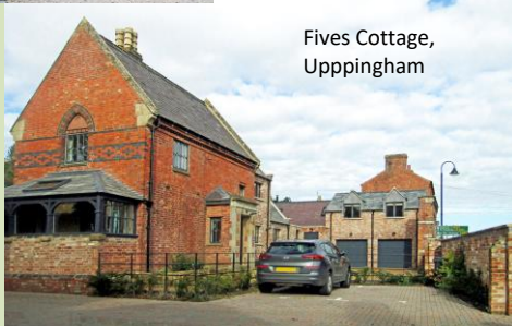
Fives Cottage, Uppingham