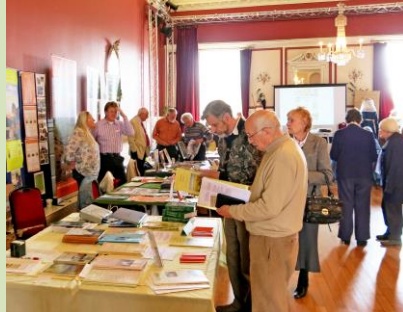
Stamford Heritage Fair