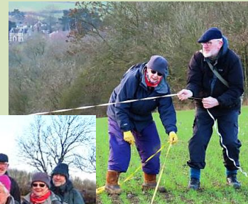
Marking-out for field walking