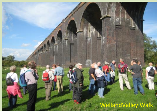
Welland Valley Walk