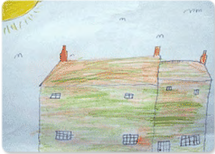
Ivydene Farm Nether Hambleton before Rutland Water

Another way of involving the community has been to devise a competition for school children. The Prince Yuri Galitzine Prize was offered for the best project on the reservoir and its surrounding area, which encouraged children to do some basic research and to talk to their grandparents and neighbours about the impact of Rutland Water.