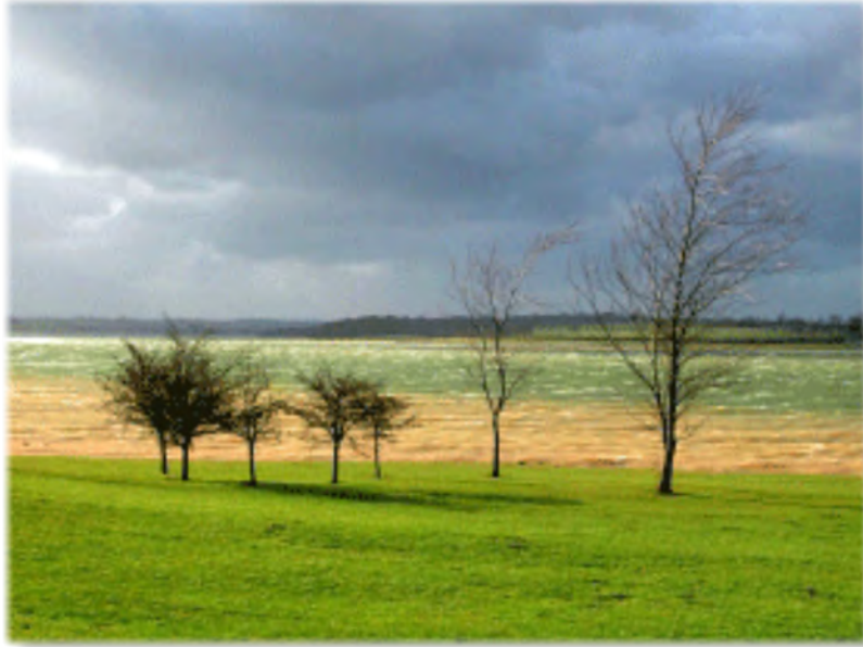
Rutland Water Today

When the twin valleys of the River Gwash were flooded in the mid-1970s, Rutland Water became Europe's largest man-made lake set in England's smallest county. This large area of water created as a reservoir, initially strongly opposed, has become a major tourist attraction internationally recognized for its wildlife.