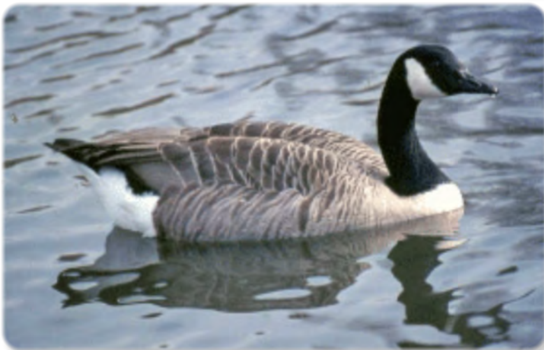
Canada Goose on Rutland Water

In fact it has provided one of the most important wild fowl sanctuaries in Great Britain.