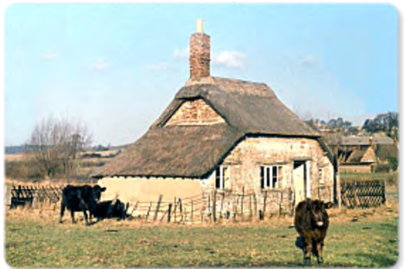
Beehive Cottage Nether Hambleton 1972