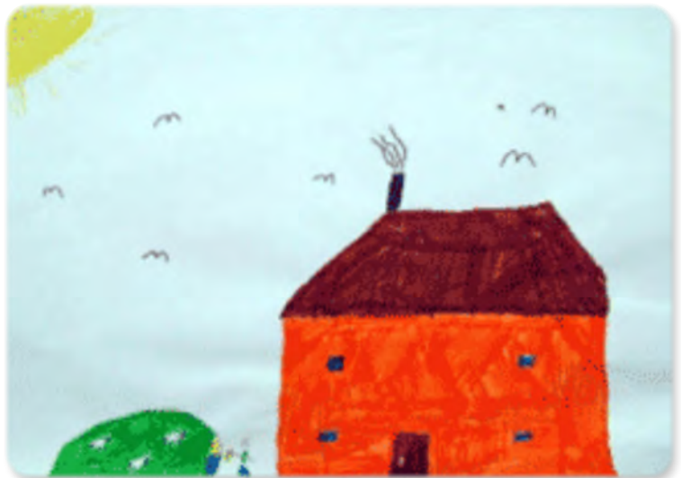
Paintings of Nether Hambleton by Megan & Jeffrey aged 10

All the landscaping round the reservoir has been very carefully and sympathetically designed, not least the dam wall which is hardly noticeable from Empingham, the nearest village.