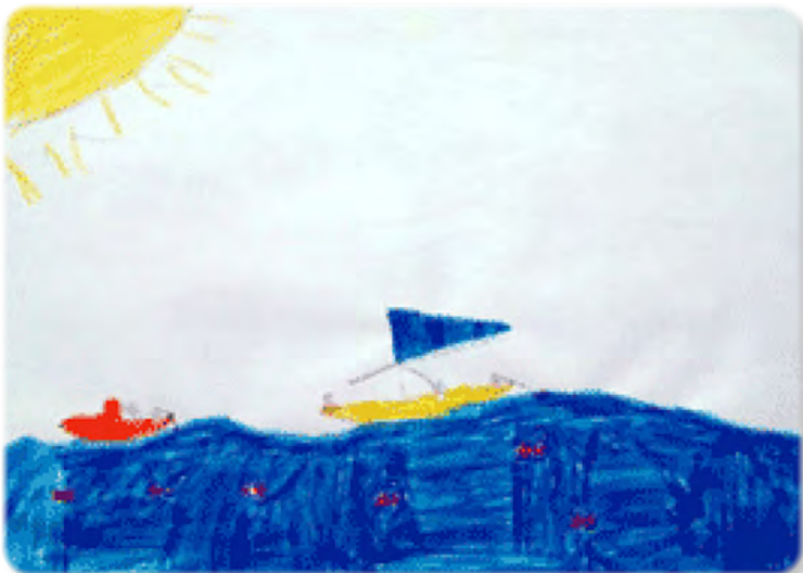
Nether Hambleton after construction of Rutland Water

Information provided by the thirty-two entries from fifty-three children has been a very valuable contribution to our project.