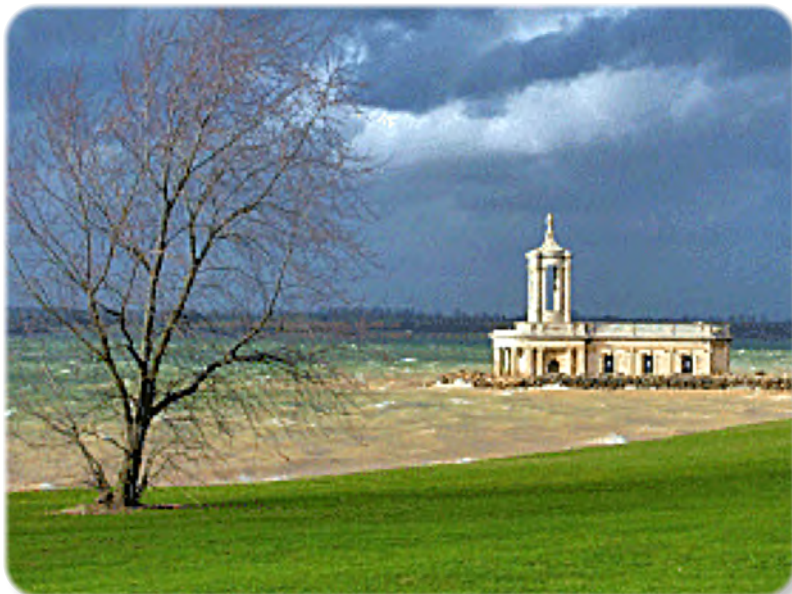
Normanton Church today

It is now a Water Museum and it is a dominant feature in the landscape at Rutland Water. Normanton Church as a building was saved, but inevitably other buildings were lost, including a number of farms and one entire village.