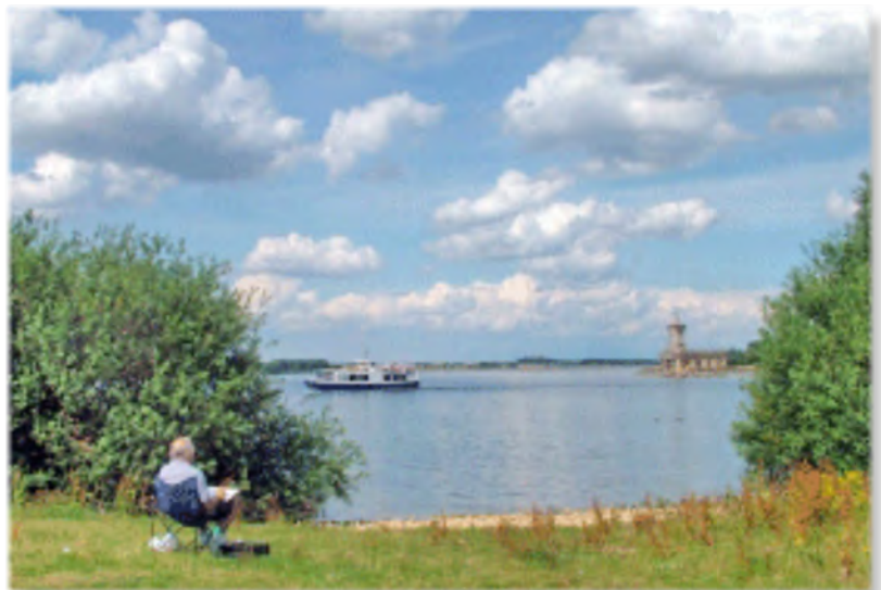
The Rutland Belle

Construction started in 1971, filling commenced in 1975, and it was full by 1979.