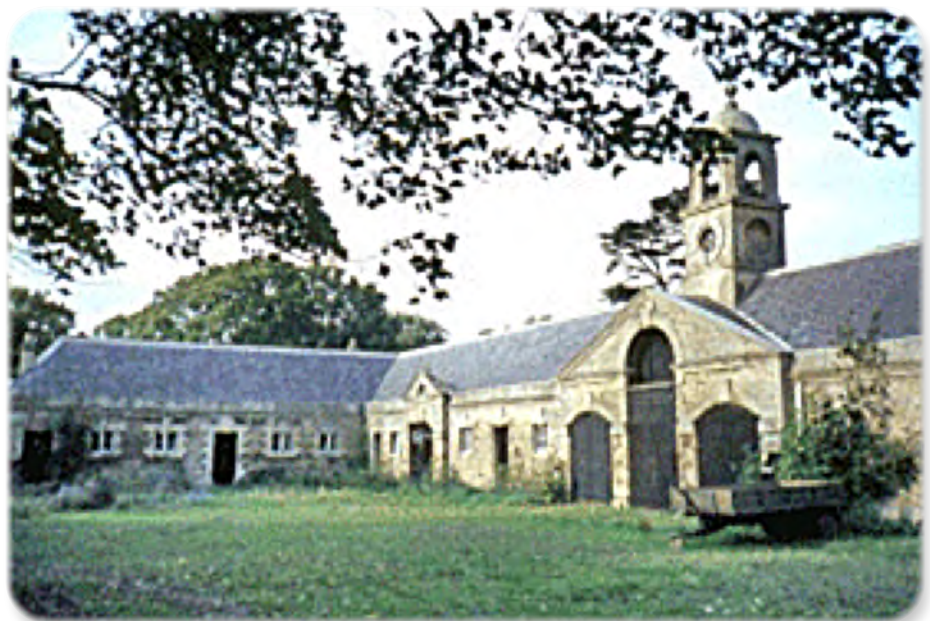
Normanton Hall Stables 1974

The adjacent stables survived and after being a prisoner of war camp in WW2, and later farmer's barns, they were converted to a hotel thanks to their unique location on the south shore of Rutland Water.