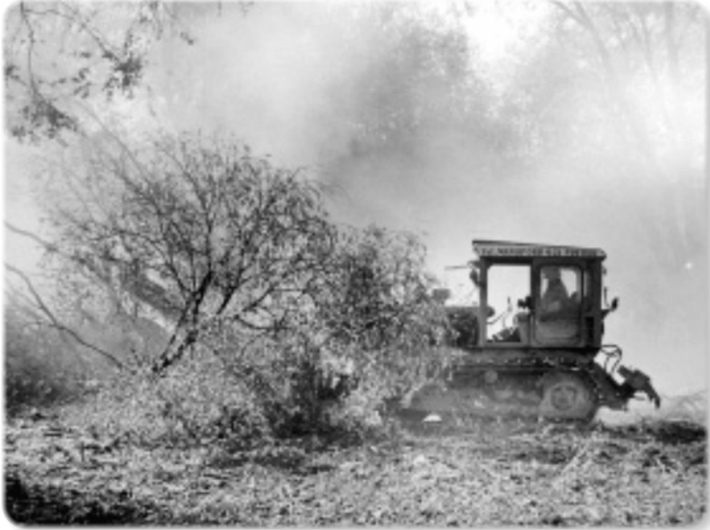
Rutland Water Construction Phase 1

Although these fears were well founded and habitats were lost, the construction of Rutland Water has resulted in the creation of extensive nature reserves which are attracting a number of endangered species, particularly the osprey.