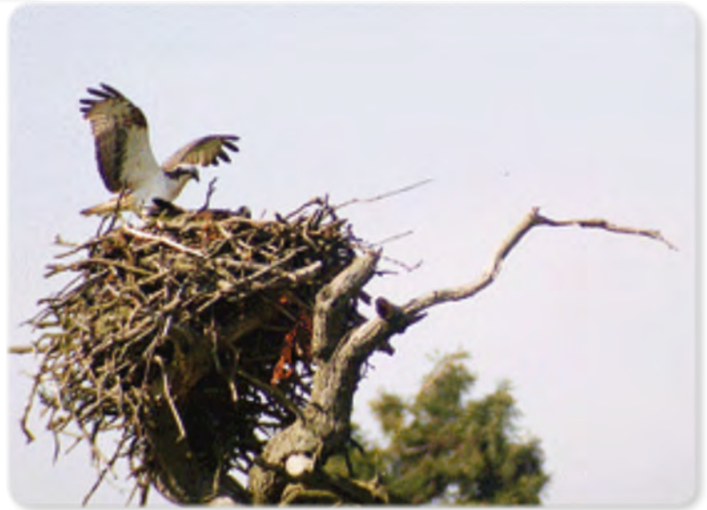
Young Osprey on nest at Rutland Water

Although these fears were well founded and habitats were lost, the construction of Rutland Water has resulted in the creation of extensive nature reserves which are attracting a number of endangered species, particularly the osprey.