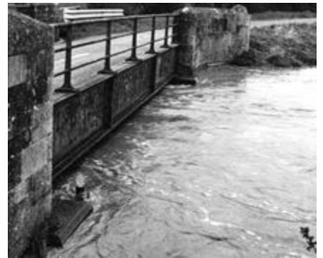
Below: Looking towards Normanton Bridge from the Hambleton Road, near Half Moon Spinney, in 1971, when most of the trees had been removed from this part of the valley. The stone pillars (arrowed) are the remains of a former Normanton Park gate